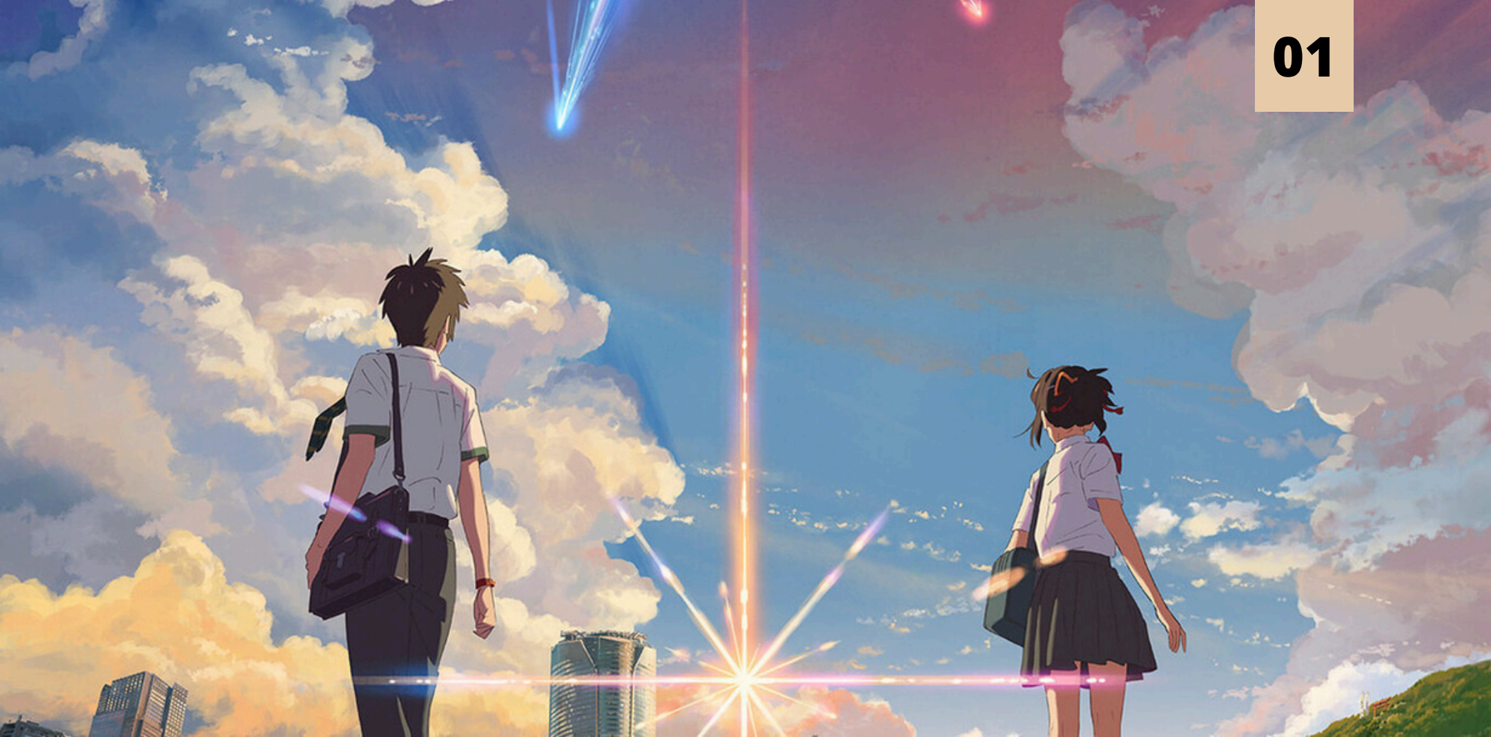
© 2016 Your Name, Film Partners

You don't come to Japan just to see places. You come to feel something. If Your Name meant something to you... this guide is your chance to step inside that feeling. To stand where they stood. To walk the same streets. To look at the same sky. This is not a list of locations. This is a path.